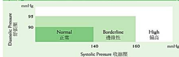
世界衛生組織制定血壓標準 Blood pressure standards established by the World Health Organization

高血壓是常見的無聲殺手，特別是對於30至69歲的人士，它能在不知不覺中慢慢升高，帶來心臟病、中風等風險。